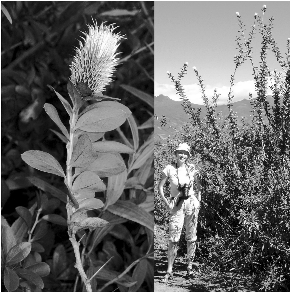
Figure 2. Arnaldoa argentea . Flowering branch (left). Habit. Photographs by Jens Madsen taken at the type locality, 2001.

rolla ex pappo vix exserta, ab ambabus corollae colore distinguitur.