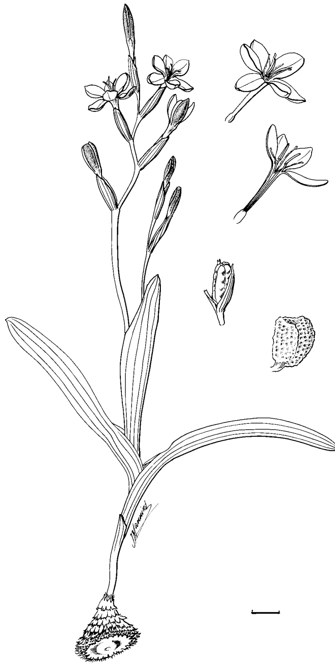
Figure 7. Morphology and floral and capsule and seed details of H. sufflava . Drawn by John Manning from live plants (Goldblatt & Nänni 11087, MO, NBG). Scale bar 1 cm; single flowers and seed much enlarged.

a pseudopetal, raising the tepals, stamens, and style branches above the basal cluster of leaves. The ovary remains close to or below ground level, and is thus protected from damage during its maturation. The ripe capsules are borne a short distance above the ground.