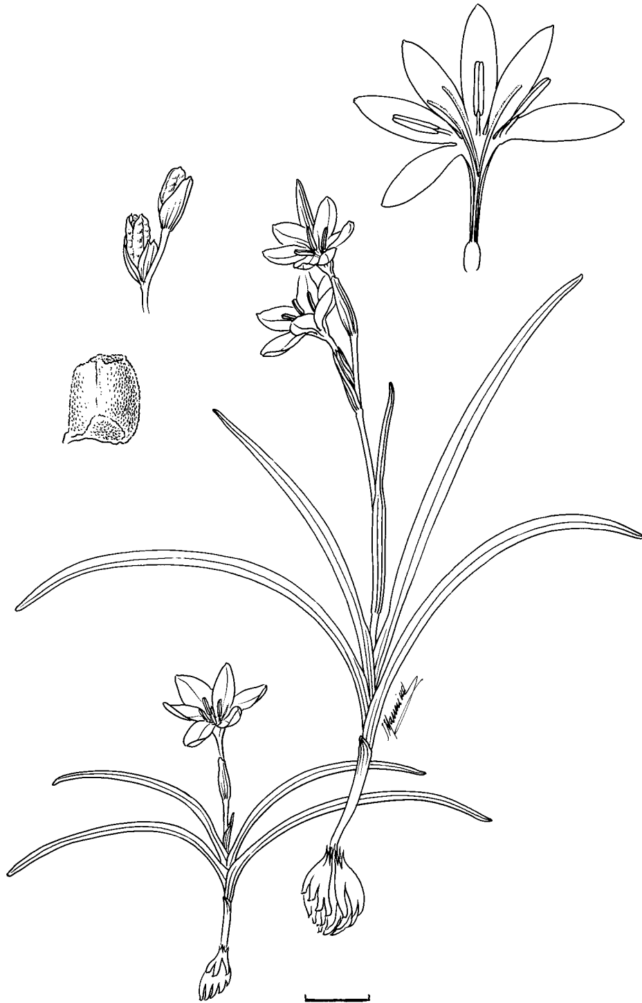
Figure 4. Morphology and floral details of Hesperantha brevistyla . Scale bar 1 cm; single flower and seed much enlarged. Drawn by John Manning from photographs and pressed plants (Goldblatt & Porter 11989, MO, NBC, PRE).