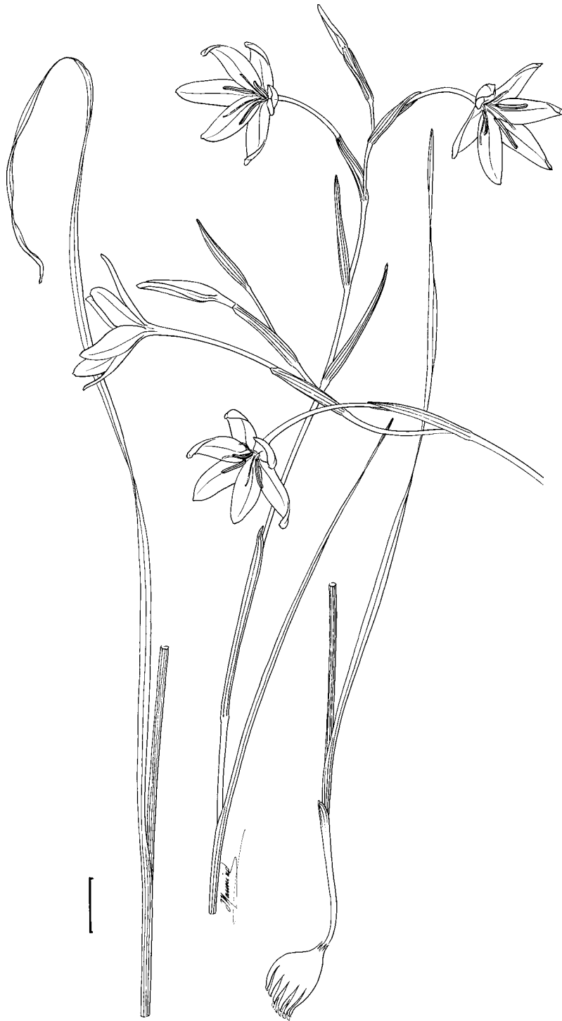
Figure 6. Morphology and floral details of Hesperantha stenosphon . Scale bar 1 cm. Drawn by John Manning from photographs and pressed plants (Goldblatt & Porter 12005 (K, NBC, MO, PRE)).