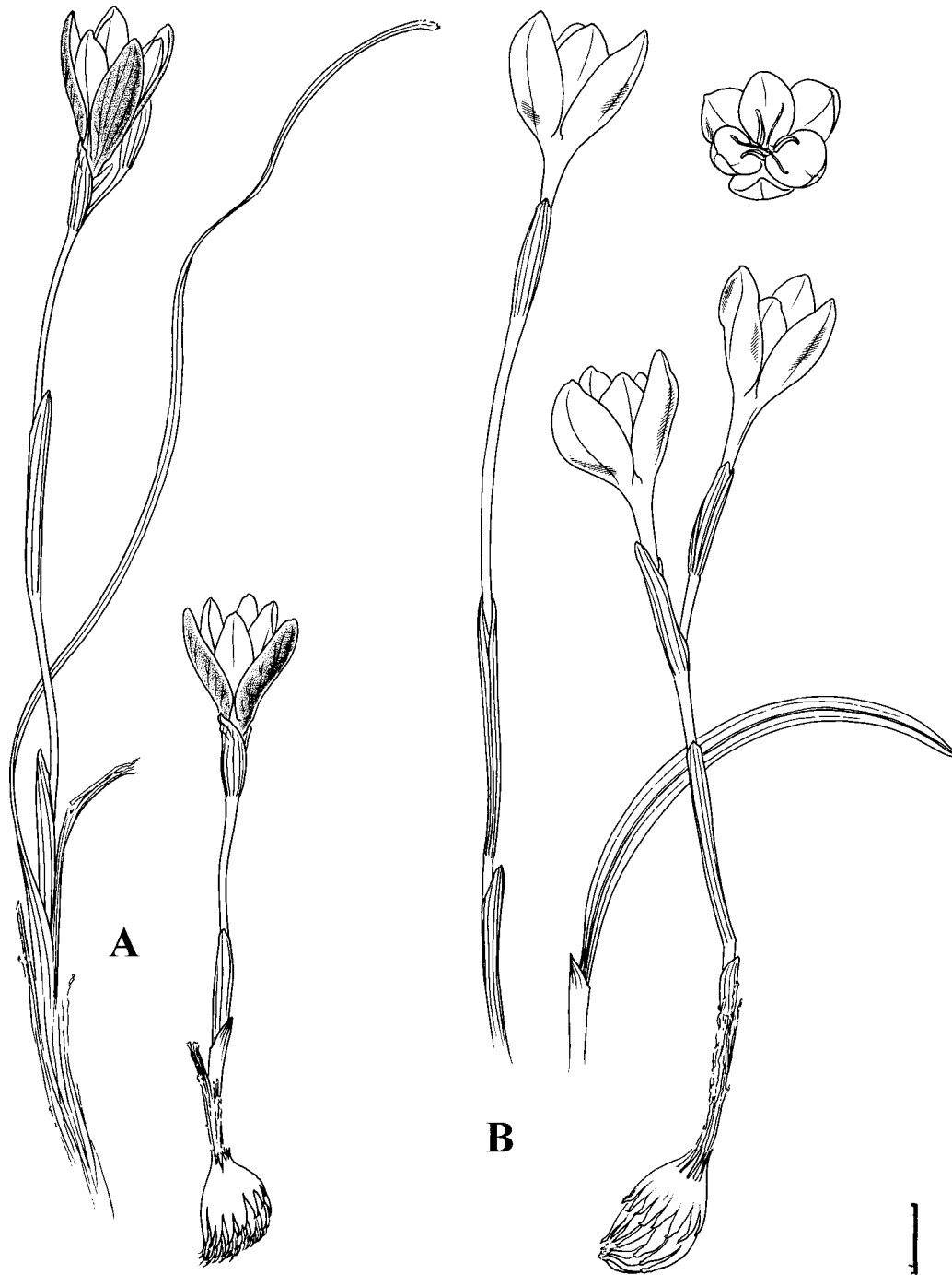
Figure 3. Morphology of H. schelpeana (A) and H. altimontana (B), full size. Drawn by John Manning from pressed plants and accompanying photographs ( H. schelpeana : Cubitt s.n., NBG; H. altimontana : Cubitt s.n., NBG (flowering plant), and Goldblatt 11239, NBG (leaf)). Scale bar 1 cm.