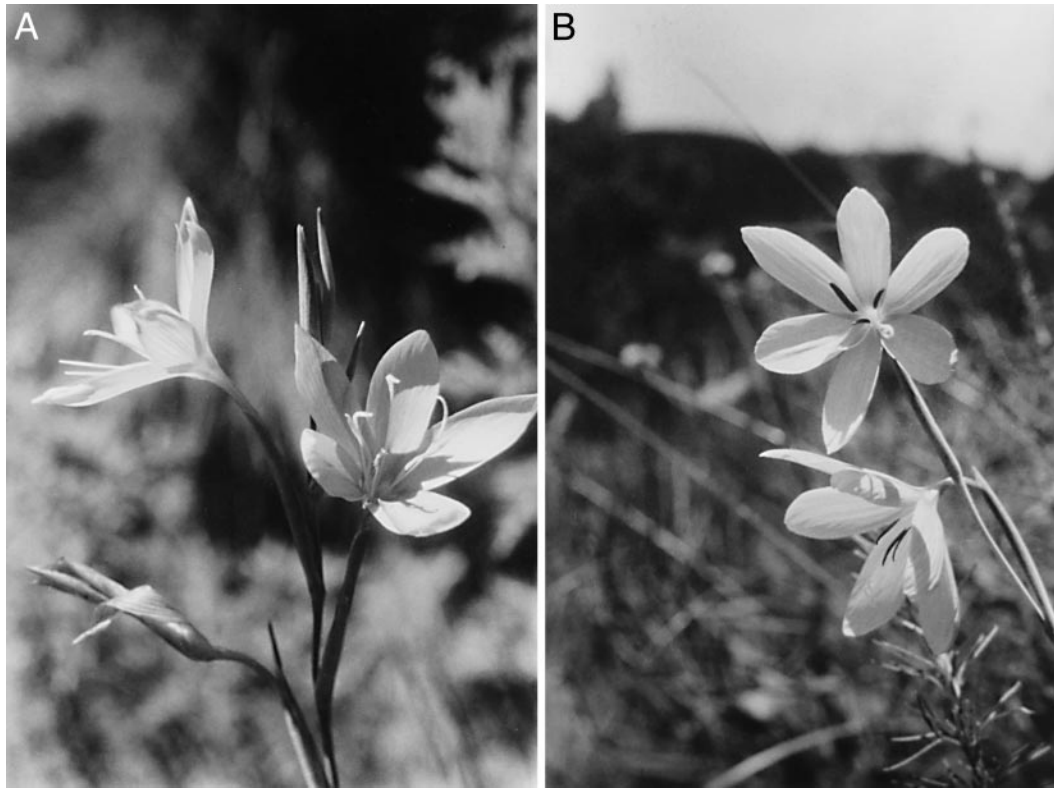
Figure 5. —A. Flowers of Hesperantha woodii (Goldblatt & Manning 11054, MO, NBG, from Naude's Nek). —B. Flowers of H. grandiflora (Goldblatt & Porter 11976, MO, NBG, from The Sentinel). Compare suberect flowers with barely curved perianth tube and large, pale-colored anthers of H. woodii with the second flower with strongly curved perianth tube and darkly colored anthers of H. grandiflora .

blades \pm linear, 2–3 mm wide, firm and erect, the midrib prominently raised, the margins slightly thickened. Spike mostly 2–4-flowered; bracts 22–30 mm long, green, becoming dry and brownish above. Flowers bright mauve-pink, pale yellow in the mouth of the tube; perianth tube (18–)22–38 mm long, cylindrical, slightly curving toward the apex, expanded near the mouth, with nectar in the base; tepals weakly ascending, elliptic, 23–27 \times 6–7.5 mm, acute. Filaments ascending, 6–8 mm long; anthers diverging, 9–10 mm long, tailed in the lower 2 mm, yellow, pollen yellow. Ovary ellipsoid, 6–8 mm long; style branches 18–20 mm long, longer than the stamens, laxly spreading. Capsules oblong, 16–18 mm long; seeds unknown.