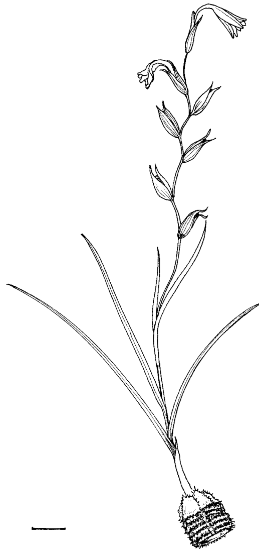
Figure 8. Morphology of H. decipiens , full size. Drawn by Yevonn Wilson-Ramsay from pressed specimens ( Goldblatt 9258 , K, MO, NBC). Scale bar 1 cm.

Plants 10–15 cm high, stem usually unbranched. Corm ovoid with an oblique flat base, 8–12 mm diam., tunics woody, concentric, somewhat scalloped into concave segments with fringed edges. Leaves 4, the lower 3 basal and largest, the uppermost inserted in the middle of the stems and sometimes entirely sheathing or with a short free unifacial tip, linear, 1.2–2 mm wide, slightly fleshy, slightly thickened in the midline. Spike mostly 3–6-flowered, flexuose; bracts 10–15 mm long, green, becoming dry above, the outer with margins united around the stem for 3–5 mm, the inner about as long as the outer. Flowers white to cream, the outer tepals pale pink to reddish or brown on the outside, strongly scented of stocks when open after dark; perianth tube slender, recurving above, 10–13 mm long; tepals subequal, lanceolate, 12–14 × 2.5–3.5 mm, spreading ± at right angles to the tube when fully open in the later afternoon. Filaments ca. 4 mm long; anthers 5–7 mm long. Ovary oblong, ca. 3 mm long; style branches ca. 12 mm long, weakly spreading, slightly shorter or slightly longer than