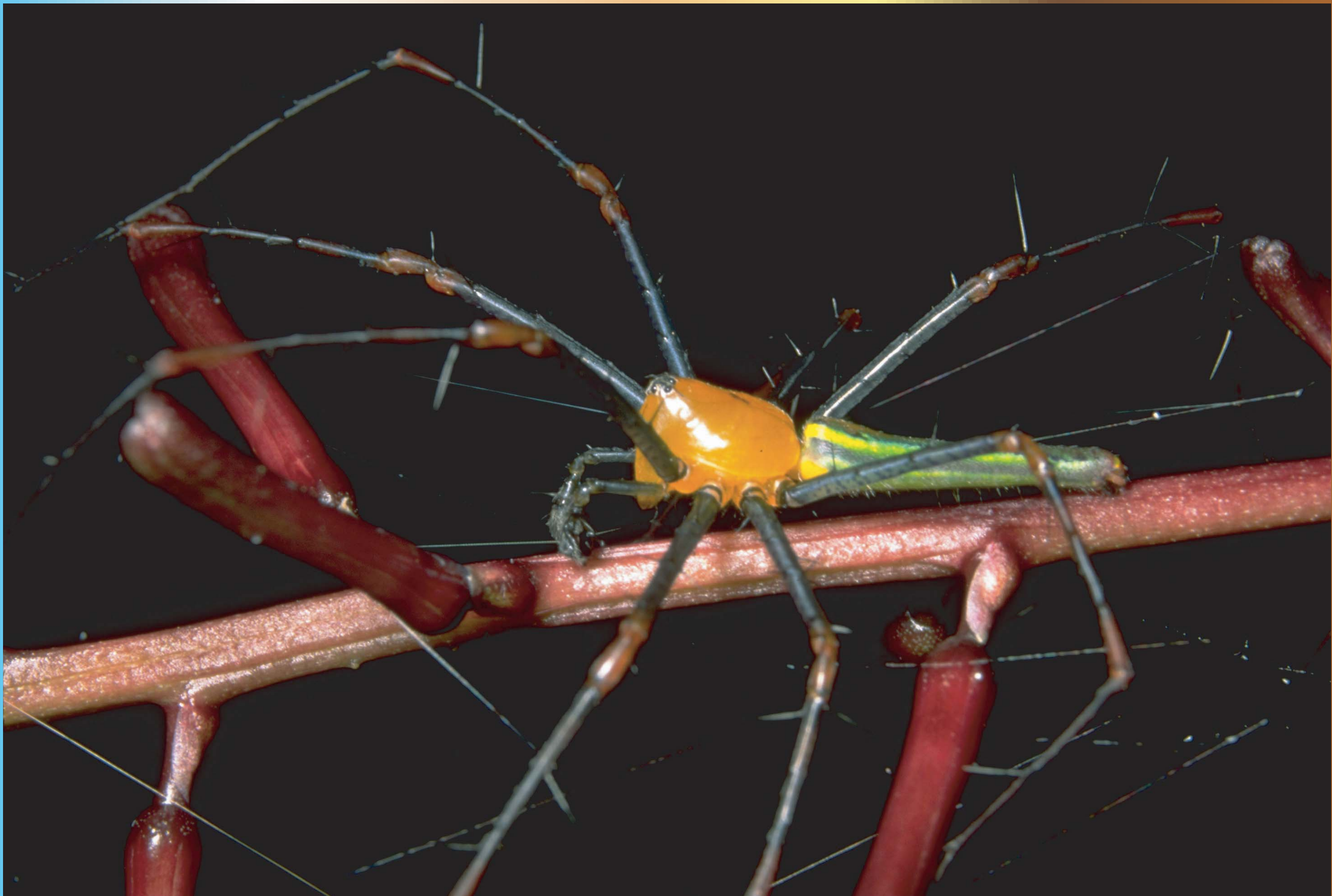
Lynx Spider, Peucetia , in the Oxyopidae, found in degraded rainforest near Sambava.

Out on their webs during the day, these conspicuous and spiny Thorn Spiders are presumably unpalatable to birds. This kind of spider is common and widespread-the same subspecies is found in Africa.