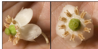
7–10 mm; Chimaphila maculata