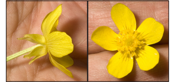
10–15 mm; Ranunculus hispidus