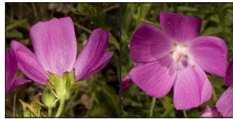
16–32 mm; Callirhoe triangulata