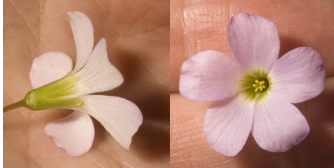
10–18 mm; Oxalis violacea