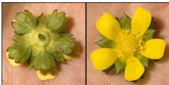
7–10 mm; Duchesnea indica