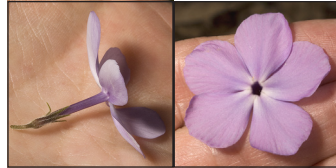
10–15 mm (including tube); Phlox divaricata