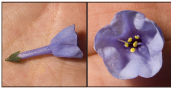
18–25 mm (including tube); Mertensia virginica

Petals and/or petal-like sepals or corolla lobes 5, all similar