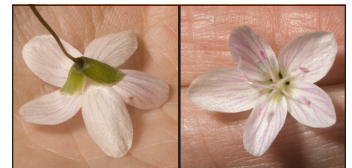
7–10 mm; Claytonia virginica