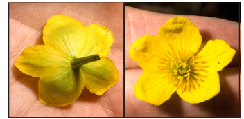
10–20 mm; Caltha palustris