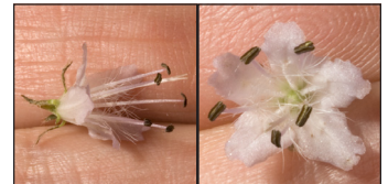
7–10 mm; Hydrophyllum virginianum