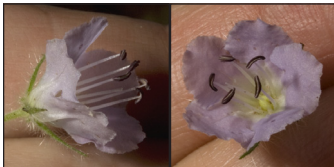
9–13 mm; Hydrophyllum appendiculatum