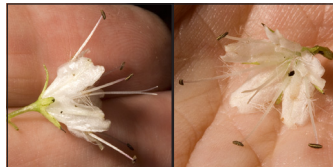
8–12 mm; Hydrophyllum canadense