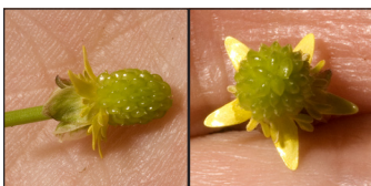
1–1.5 mm; Ranunculus abortivus