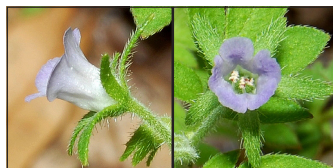
3–5 mm; Phacelia covillei