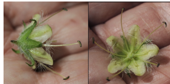
8–13 mm; Hydrophyllum macrophyllum