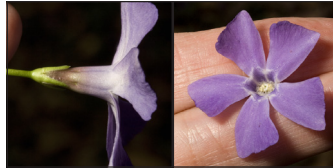
10–15 mm (including tube); Vinca minor