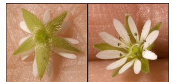
3–5 mm; Stellaria media