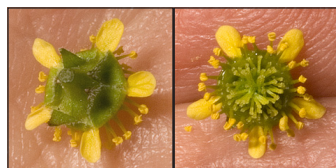
< 1 mm; Geum vernum