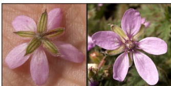
5–8 mm; Erodium cicutarium