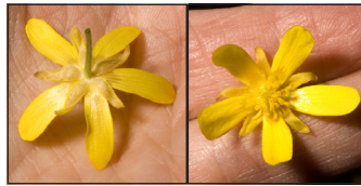
12–15 mm; Ranunculus fascicularis