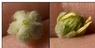
< 1 mm; Ranunculus testiculatus