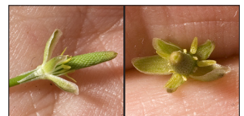
< 1 mm; Myosurus minimus