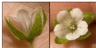
5–8 mm; Ellisia nyctelea