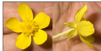
Ranunculus hispidus Rough Buttercup • 10–15 mm