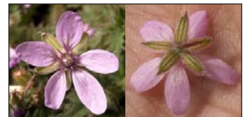
Erodium cicutarium Red-Stemmed Stork's-Bill • 5–8 mm