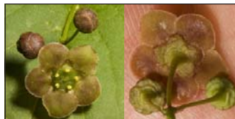
Euonymus obovatus • Running Strawberry-Bush • 4–5.5 mm