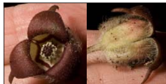
Asarum canadense Wild Ginger • 20–40 mm