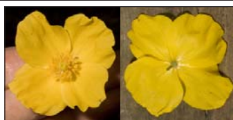
Stylophorum diphyllum Wood Poppy • 20–30 mm