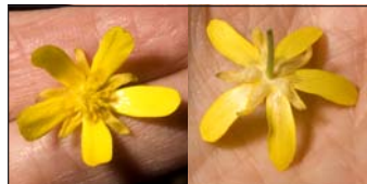
Ranunculus fascicularis Early Buttercup • 12–15 mm