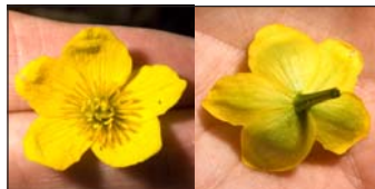
Caltha palustris Marsh Marigold • 10–20 mm