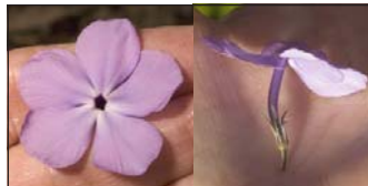
Phlox divaricata Wild Blue Phlox • 10–15 mm