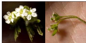
Chaerophyllum tainturieri Tainturier's Wild Chervil • < 1 mm