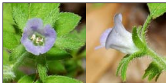
Phacelia covillei Coville's Phacelia • 3–5 mm