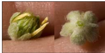
RANUNCULUS TESTICULATUS Burr Buttercup • < 1 mm