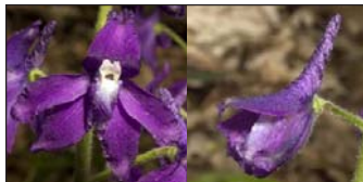
Delphinium tricorne Dwarf Larkspur • 11–15 mm