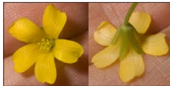
OXALIS STRICTA • Common Yellow Wood Sorrel • 4–9 mm