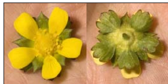
DUCHESNEA INDICA Indian Strawberry • 7–10 mm