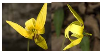
Erythronium americanum Yellow Trout Lily • 20–50 mm