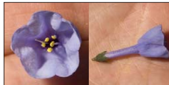
Mertensia virginica Virginia Bluebells • 18–25 mm