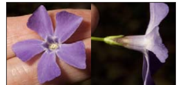
VINCA MINOR Graveyard Myrtle • 10–15 mm