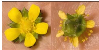
Geum vernum Spring Avens • < 1 mm