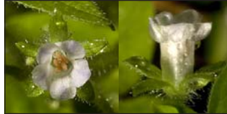
Phacelia ranunculacea Buttercup Phacelia • 2.5–5.5 mm