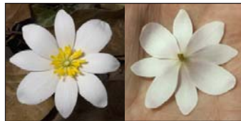
Sanguinaria canadensis Bloodroot • 15–25 mm