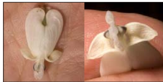
Dicentra canadensis Squirrelcorn • 15–20 mm