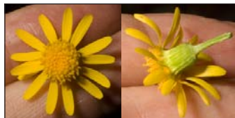
Packera glabella Butterweed • rays 6–15 mm