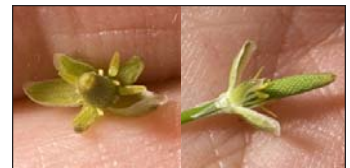
Myosurus minimus Mousetail • < 1 mm