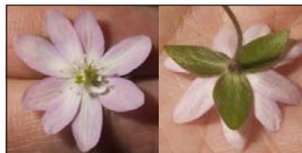
Thalictrum thalictroides Rue Anemone • 10–15 mm