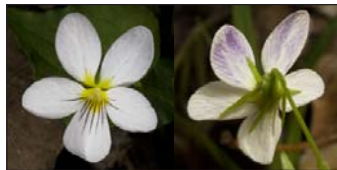
Viola canadensis Canada Violet • 15–25 mm