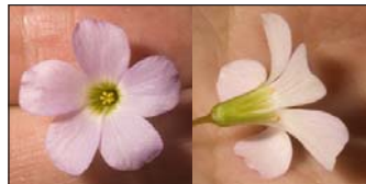
Oxalis violacea Violet Wood Sorrel • 10–18 mm