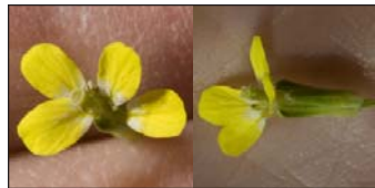
ERYSIMUM REPANDUM • Treacle Mustard • 6–10 mm