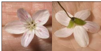
Claytonia virginica Spring-Beauty • 7–10 mm