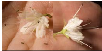
Hydrophyllum canadense Canada Waterleaf • 8–12 mm