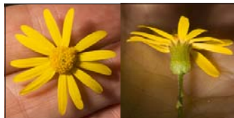
Packera aurea • Heart-Leaved Golden Ragwort • rays 6–13 mm