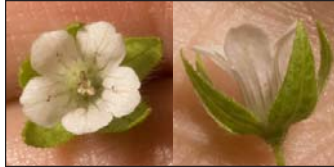
Ellisia nyctelea Aunt-Lucy • 5–8 mm