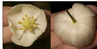
Podophyllum peltatum May Apple • 18–28 mm