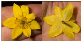
Caltha palustris Marsh Marigold • 10–20 mm