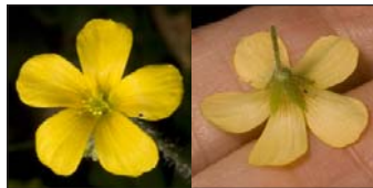
Oxalis dillenii • Upright Yellow Wood Sorrel • 4–9 mm