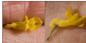
Corydalis flavula • Short-Spurred Corydalis • 6–11 mm