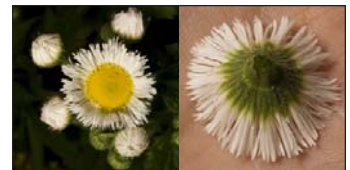
Erigeron philadelphicus • Philadelphia Fleabane • rays 5–10 mm