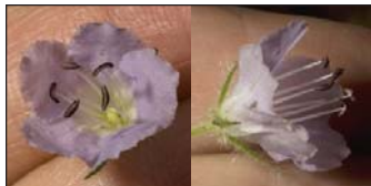
Hydrophyllum appendiculatum Appended Waterleaf • 9–13 mm