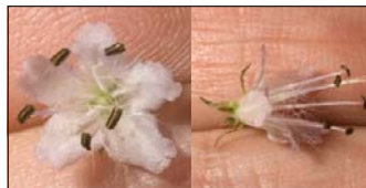
Hydrophyllum virginianum Virginia Waterleaf • 7–10 mm