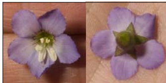
Polemonium reptans • Spreading Jacob's-Ladder • 12–16 mm