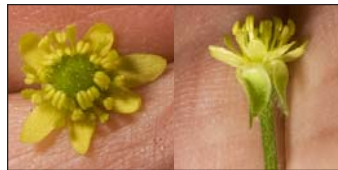
Ranunculus recurvatus Hooked Buttercup • 3.5–6 mm