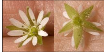
STELLARIA MEDIA Common Chickweed • 3–5 mm