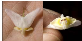
Dicentra cucullaria • Dutchman's-Breeches • 15–20