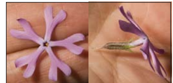
Phlox bifida Cleft Phlox • 10–15 mm