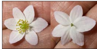
Thalictrum thalictroides Rue Anemone • 10–15 mm