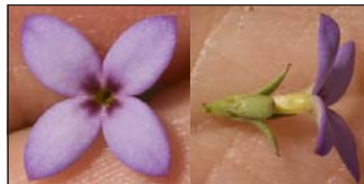
Houstonia pusilla Small Bluets • 6.5–13 mm