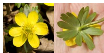
ERANTHIS HYEMALIS Winter Aconite • 14–27 mm