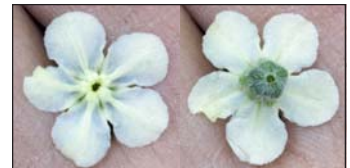
Cynoglossum virginianum Wild Comfrey • 6–11 mm