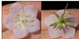
Phacelia bipinnatifida • Loose-Flowered Phacelia • 8–12 mm