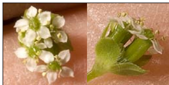
Chaerophyllum procumbens Spreading Wild Chervil • < 1 mm