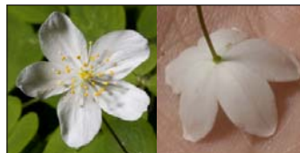
Enemion biternatum False Rue Anemone • 7–10 mm