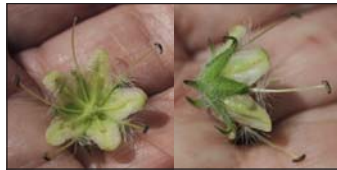
Hydrophyllum macrophyllum Large-Leaved Waterleaf • 8–13 mm