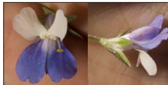
Collinsia verna Blue-Eyed-Mary • 11–16 mm