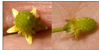
Ranunculus abortivus • Kidney- Leaved Buttercup • 1–1.5 mm