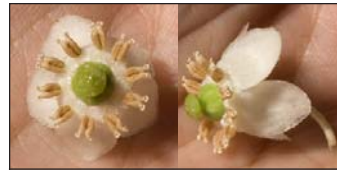
Chimaphila maculata Spotted Wintergreen • 7–10 mm

© 1 March 2011 Kay Yatskievych • Kay.Yatskievych@mobot.org